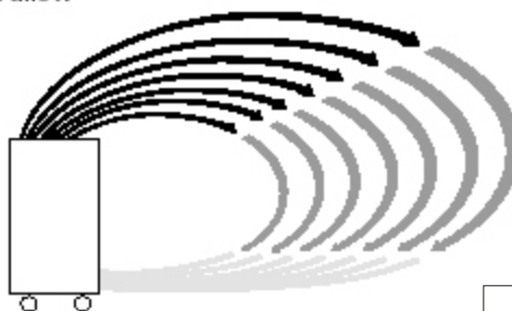
Standalone Airflow Pattern

Call 1-800-626-0664 www.allerairsolutions.com