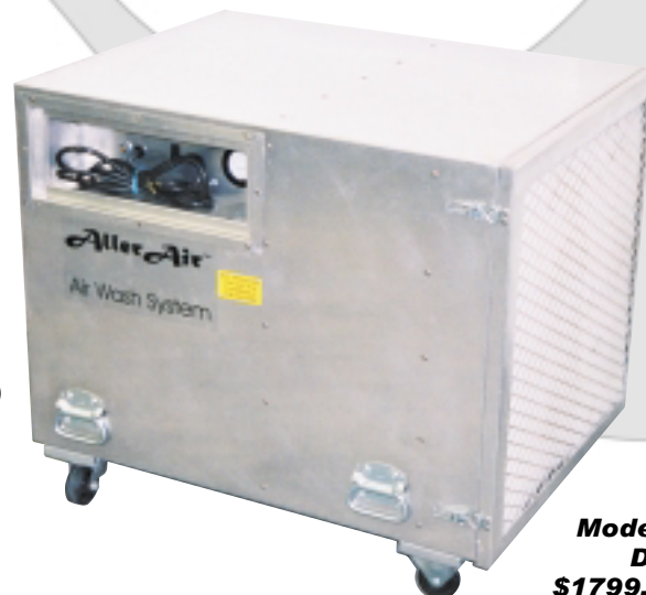
Model AW 4000 Dual Purpose $1799.98 Variable Speed

AllerAir_MK:IndustrialDocuments:AW4000DP Dec/10/2004