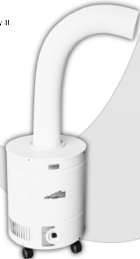
AllerAir™ Model 5000 W-VOCARB

Reduce Gases, Odors and Smoke in the air you breathe